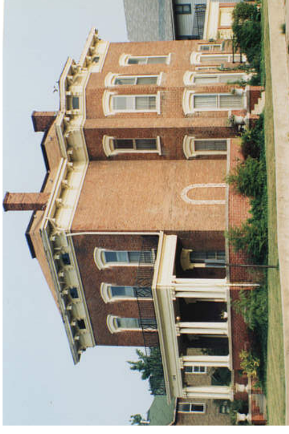
144 West 13 th Street in 1906 (top) and 1991 (bottom). As you can see, the main entrance to this property once faced Brown St. (now Brown-Delaware).