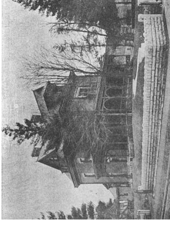
The Winifred Stilwell residence in 1901.

This month we are highlighting some of the house lost to progress. As such, we're not sure where they were located. Do you know?