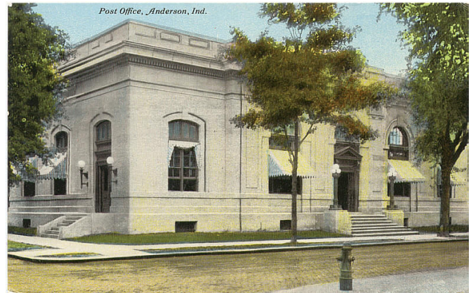
The Anderson Post Office before the 2 nd floor was added.

Don't forget to register your Marsh Fresh IDEA card – they will donate 1% of the purchase price of Marsh brand products to ADNA if you register with our Express Code " 351501583 " at www.marsh.net or when you checkout at the store. Shop Marsh and help ADNA!