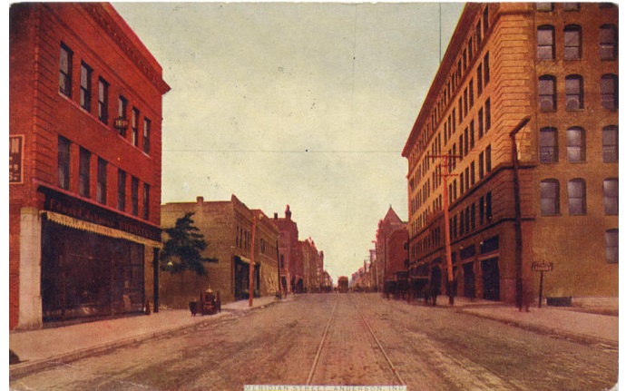
Looking down Meridian Street North from 12 th Street in about 1910. At right is the Union Building before the Paramount Theater was built. On the left is the Edward Johnson Furniture store.

e-mail: info@adnahome.org website: www.adnahome.org