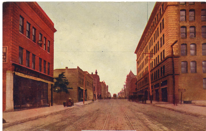
Looking down Meridian Street North from 12 th Street in about 1910. At right is the Union Building before the Paramount Theater was built. On the left is the Edward Johnson Furniture store.

e-mail: info@adnahome.org website: www.adnahome.org