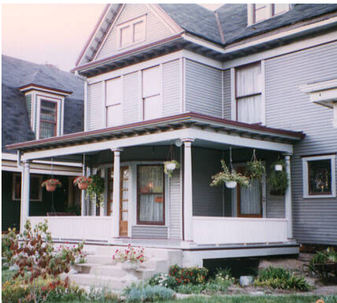
The same house 4 years later. Since this picture was taken, a new roof has been installed as well.