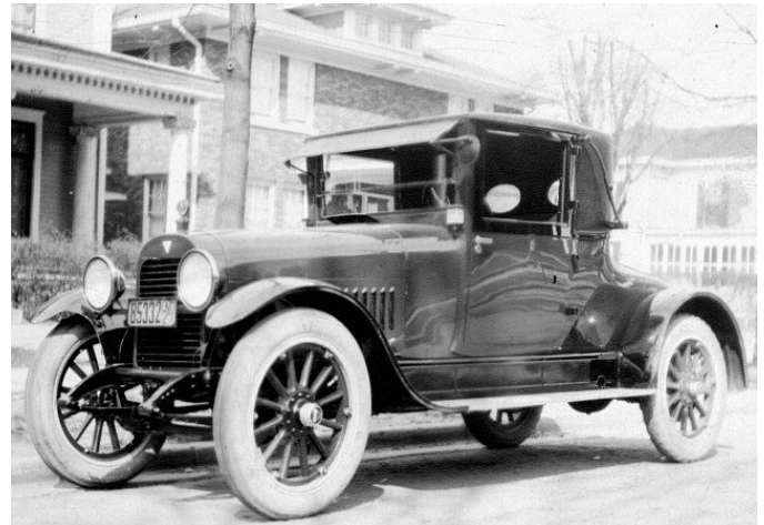
Photographed in front of 310 (left) and 306 (right) West 12 th Street in a photograph from the late teens or early twenties.