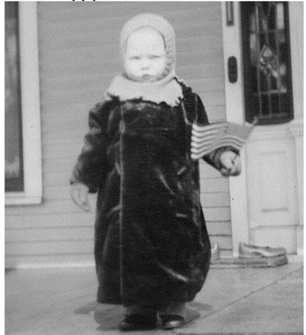
Can you picture this little one wishing all a Happy New Year!! The picture is from scanned negatives from 310 West 12 th Street and was photographed in about 1917.