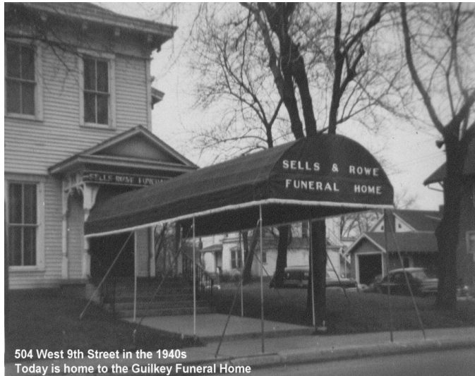
Keeping with our funeral home theme, this house at 504 West 9 th Street was known as the Sells and Rowe Funeral Home in the 1940s. Today, the Guilkey Funeral Home is located here.