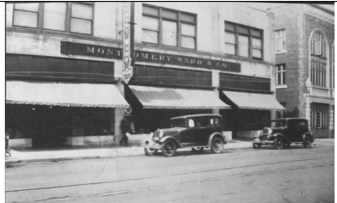
A Ward Awning photo of the Montgomery Ward & Co. building at 1325 Meridian St. from the 1920s. Today this building is home to the Music Today Store.