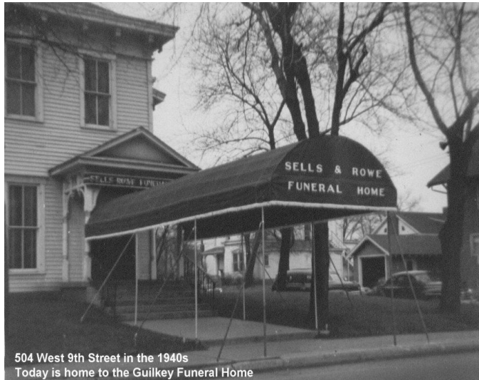
504 West 9th Street in the 1940s Today is home to the Guilkey Funeral Home Keeping with our funeral home theme, this house at 504 West 9 th Street was known as the Sells and Rowe Funeral Home in the 1940s. Today, the Guilkey Funeral Home is located here.