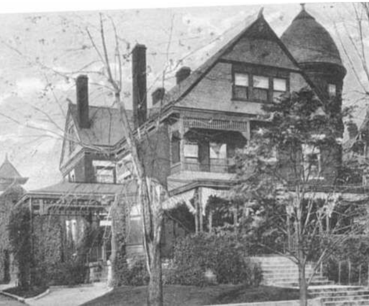
1011 Jackson Street in 1917.

and home was used as the Y.W.C.A. from about 1915 into the 1950s when the current building was built at West 11 th Chase St. The home sat just North of what is now the initial building at the corner of West 11 th and Jackson St. It was demolished in 1960 to make way for drive-up banking services (these are gone as well – the lot is used for parking now).